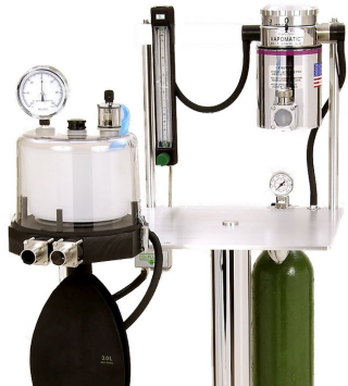
Anesthesia System Calibration Checks

One Service Visit - One Price (price is for labor service only - replacement parts are additional)