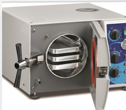
Autoclave/Sterilizer Maintenance Cleaning

A clean and well lubricated microscope can make all the difference to your veterinary hospital and happier co-workers.