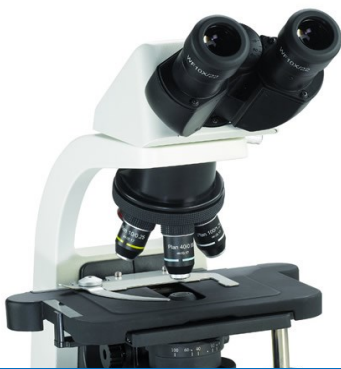
Microscope Cleaning & Lubrication Services

We also carry a wide array of anesthesia system parts such as seals, gaskets, pop off valves, and many other parts that may be malfunctioning which are usually shown up during an onsite maintenance.